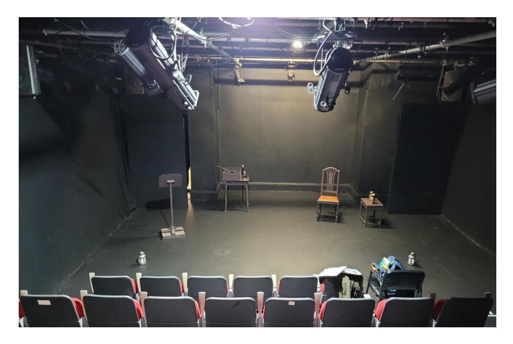
The set for Jekyll & Hyde